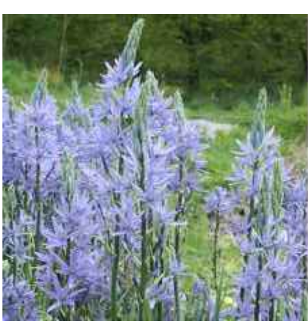
Cammassia leichtlinii caerula